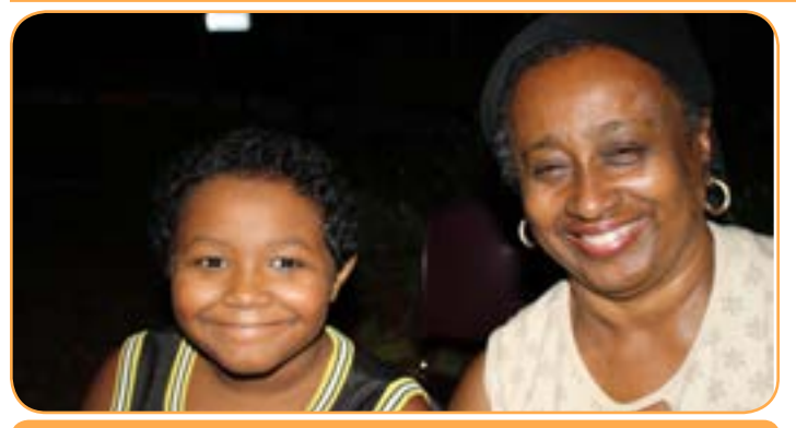
Jazz Music on the Plaza makes me smile