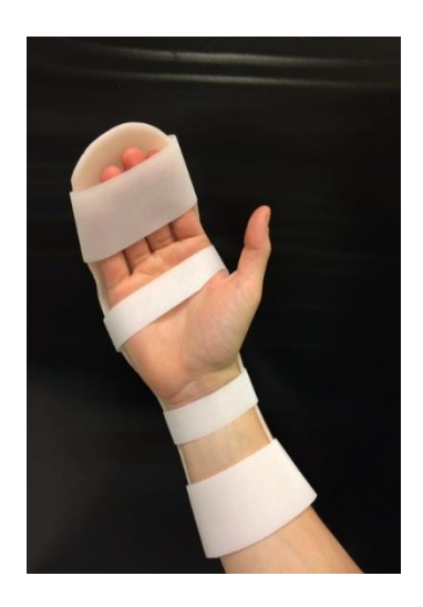
EAM: Week 1 to 2 touching IF or 25% EAM: Week 2 to 3 touching LF or 50%