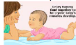
Enjoy tummy time together to help your baby's muscles develop.