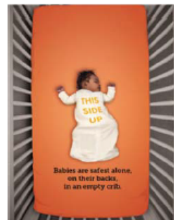
Babies are safest alone, on their backs, in an empty crib.