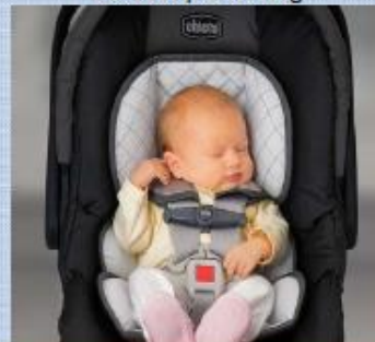
Car seat positioning