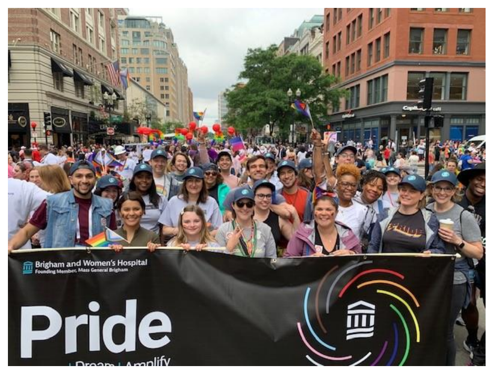
Boston Pride for the People Parade 2023 – Brigham and Women's Hospital