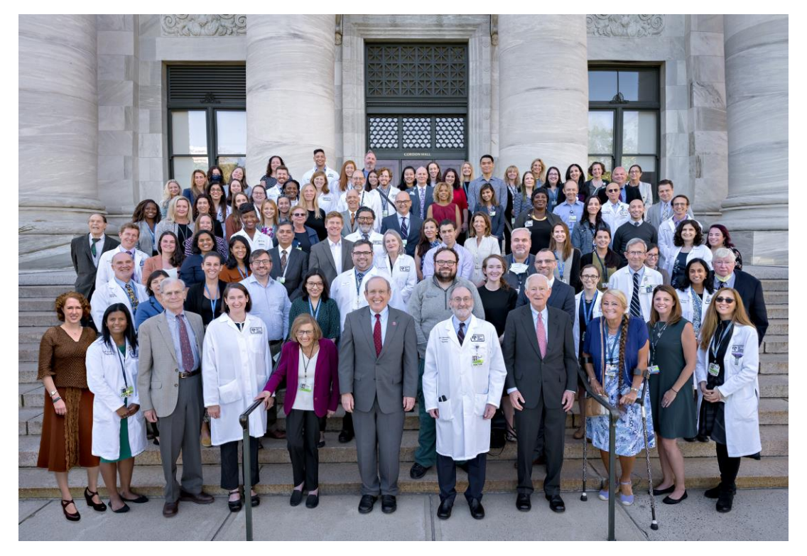
Department of Psychiatry Faculty and Trainees