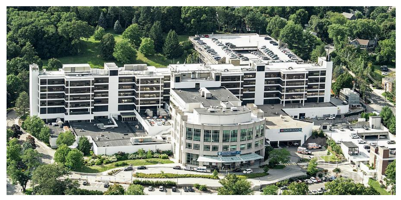
Brigham and Women's Faulkner Hospital

The Department of Neurology includes the Center for Brain Mind Medicine (CBMM), located at 60 Fenwood Road, Boston MA. The CBMM provides comprehensive evaluations of complex diagnostic conditions at the interface of psychiatry and neurology. The CBMM fosters a multidisciplinary approach to clinical care and research and is comprised of a team of specialists in behavioral neurology, neuropsychiatry, geriatric psychiatry, neuropsychology, and social work. The population of patients served at the CBMM includes adults who present with cognitive, emotional, or behavioral difficulties secondary due to disease, injury, or developmental disorders of the central nervous system. These conditions include mild cognitive impairment, neurodegenerative conditions, epilepsy, stroke, brain tumors, cancer, multiple sclerosis, traumatic brain injury, neurobehavioral, primary psychiatric syndromes, and neurodevelopmental syndromes. The training opportunities at the CBMM include neuropsychological assessment and group cognitive rehabilitation interventions.