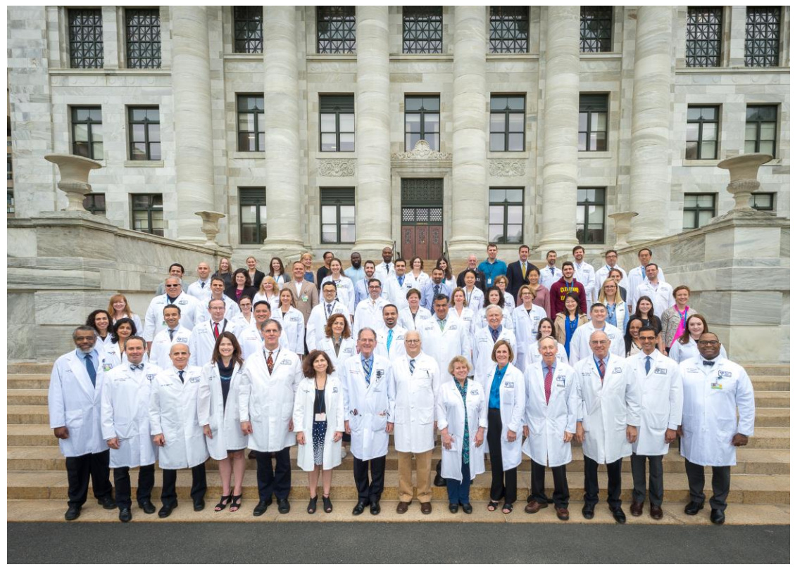
Department of Neurology Faculty and Trainees