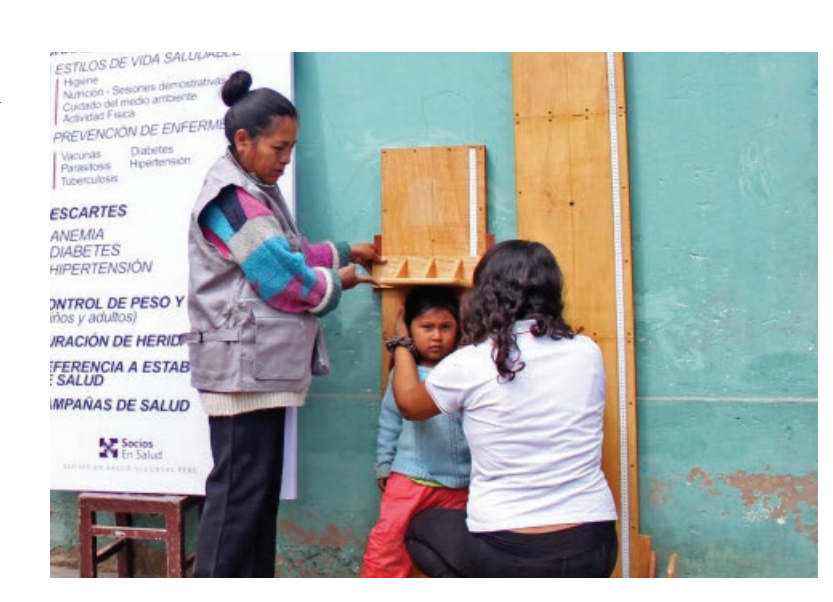
Mobile Clinic, Carabayllo District, Lima, Peru

Socios En Salud (SES) is the division's partner organization in Peru. SES focuses on patient care and clinical research. SES delivers multiple allied community-based projects centered on mental health, child development, and micro financing in a number of impoverished communities in Lima and Pisco/Chincha. SES collaborates with the division and the DGHSM at HMS on research funded by NIH and other agencies. Areas of focus include TB, HIV, infection control, maternal health, and early child development. With support from HMS, SES has implemented a research core to evaluate incoming research proposals for their relevance to the SES strategic priorities, potential impact on the populations served, and the impact on capacity building at the site.